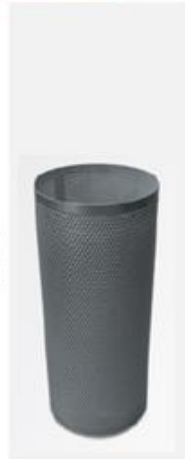
C2-90 Stainless Steel 304L 25 \mu Sintered Mesh Screen