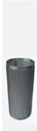
B2-90 Stainless Steel 304L 50 \mu Wedge-Wire Screen