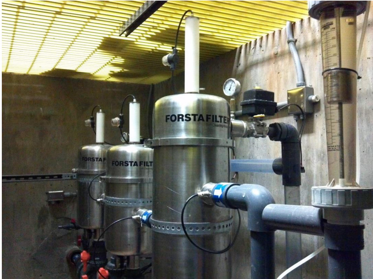
Laguna's Three-Stage Filtration

In order to examine the particle removal efficiency of the system at four years in operation, Sweetman collected one gallon samples prior to the 1000 \mu filter (raw spring water) and after the 25 \mu filter.