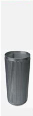
B2-90 Stainless Steel 304L 1000 \mu Wedge-Wire Screen