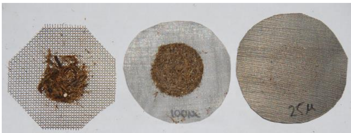
1000 \mu +

To assess the debris present in the raw spring water, Forsta engineers conducted tests using a descending sequence of screen mesh sizes. The test showed the concentration of debris at select sizes, and also indicated the finest screen appropriate to the Encinal spring water source.